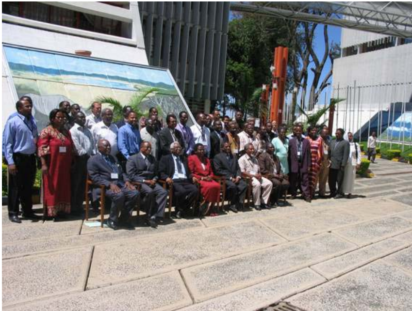
Participants of the Stakeholders' Workshop held in Arusha, Tanzania, October 2005

The stakeholders' workshop reviewed the process and products of the priority areas selected in 1999 and the products of the three previous workshops reported above. It also made reference to the 2005 Health Sector Review, the National Strategy for Growth and Reduction of Poverty (NSGRP, 2005), the preliminary findings of the Demographic Health Survey of 2004/5 (TDHS, 2005), and the Health Sector Strategic Plan of 2003-2008. They concluded their work into two categories of health research, biomedical and health systems researches.