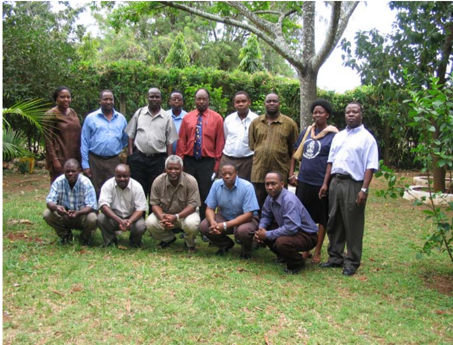
Members of a Technical Group in group photography at Panori Hotel in Tanga, August 2005

The important contribution to the current national health research priorities were synthesized and agreed during the stakeholders workshop held in Arusha in October 10-12, 2005. This stakeholder's workshop was attended by 58 participants including researchers, academia, policy-makers, and journalists, representatives of non-governmental organizations, international bilateral organizations and development partners.